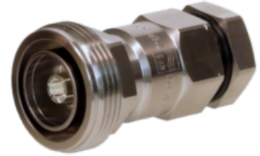
OMNI FIT™ Premium Connectors