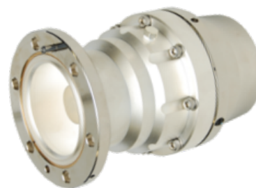
Connector 3-1/8" EIA