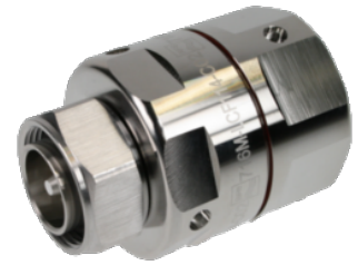
OMNI FIT™ Standard Connectors

OMNI FIT™ high performance connectors are designed for use with both CELLFLEX® (copper) and CELLFLEX® Lite (aluminum) cables. They are designed specifically to provide the highest quality connector-cable interface while simplifying and speeding up connector attachment. All RFS connectors are fully tested for mechanical and electrical compliance to industry specifications. The 7-16 connector is the most rugged RF connection meeting all requirements even under the most severe environmental conditions.