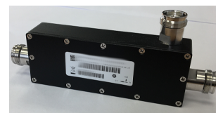
CDS20-43-698-2700-01 Directional Coupler

RFS CDS*-43 series Directional Couplers have been designed for a variety of wireless applications in the frequency band from 698 to 2700MHz. The unit couples off a defined fraction of a RF signal from 5 to 30 dB with minimal reflections or loss. The broad frequency range is ideally suited for multi-band distributed antenna systems or in combination with RADIAFLEX® radiating cables.