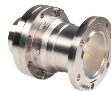
318EIA Connector for HCA300 Cable

Radio Frequency Systems line of high-performance HELIFLEX® coaxial cable connectors are characterized by excellent gas tightness and extremely low losses. HELIFLEX® connectors can be installed with basic hand tools. Tab flare of outer connection and use of o-ring sealing simplifies installation of the connector. RFS connectors are fully tested for mechanical and electrical compliance to specifications. HELIFLEX® connectors have excellent electrical values and provide outstanding performance for the most demanding applications. The RFS connector design provides maximum sealing integrity and gas tightness.