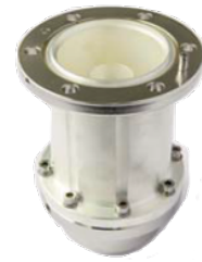
Connector 3-1/8" EIA

RFS connectors are fully tested for mechanical and electrical compliance specifications. HELIFLEX®Lite premium connectors have excellent electrical values and provide outstanding performance for the most demanding applications. The RFS connector design provides maximum sealing integrity and gas tightness.