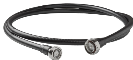
7M7FS12F-0400FFP for EXAMPLE

Radio Frequency Systems' CELLFLEX® Factory-Fit Jumpers feature specially designed connectors which are soldered-on in a strictly controlled industrial process to ensure industry leading performance for today's high-performance wireless systems. The connector design and manufacturing process has been optimized to produce premium VSWR and IM levels. Injection molded boots provide reliable and repeatable additional sealing level and strain relief. Our facilities produce and stock all popular lengths as required by the industry, and can deliver custom lengths with premium VSWR and IM levels on request.